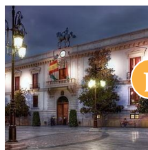
E City Council